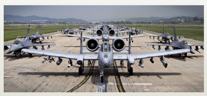
51st Fighter Wing Public Affairs Unit 2067 APO, AP 96266 Active on Facebook, Youtube and the World Wide Web www.osan.af.mil

Air Force Operations Command (AFOC) Air Mobility & Recon Command Air Defense Missile Command Air Defense & Control Command Korea Air Operations Center (KAOC)